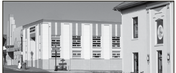
The center of the Deco District revival is the former Midway Theater, Bank of Newport and City Hall.

While there is still much to do, today this corner serves as the center of the Deco District's revival. CCNA's color/design consulting team is working with property owners to realize the vision of a unique and vibrant historic district in the art deco style.