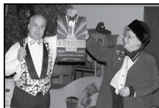
CCNA special events promote the art deco culture.

The volunteer members of CCNA are committed to preserving Newport's unique art deco heritage, promoting the art deco era