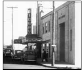
Midway Theater/Bank of Newport in 1938

Of the many buildings within the district, notable art deco structures include the original Midway Theater and Bank of Newport, built side-by-side at the same time in 1936 at the corner of Alder Street and Coast Highway.