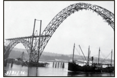
Yaquina Bay Bridge five months before opening to traffic.

When the Yaquina Bay Bridge opened in 1936, Newport joined the modern age of highway transportation. This shift to an auto-oriented culture invigorated and reoriented Newport's central business district. As this area developed along the new Highway 101, the bridge's modern, art deco styling influenced many of the new buildings constructed from the